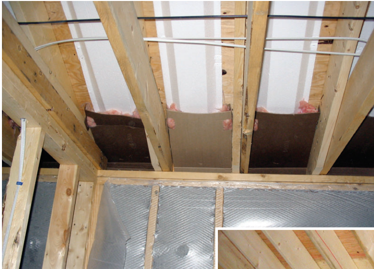
Figure 7. In an effort to prevent windwashing of attic insulation, the author first tried using cardboard baffles above the top plates, then stuffed the gaps between the baffles and the polystyrene ventilation chute with fiberglass batts (left). His discovery of a plastic baffle called AccuVent (below) made this process much easier.

sloped ceilings was troublesome, and I ended up having to stuff the gaps with fiberglass (Figure 7). While cardboard baffles fit well for truss roofs, they don't work as well for a stick-framed roof because the lapping of the ceiling joist over the side of the rafter is a difficult area to seal. So we spent a lot of time cutting the cardboard to fit.