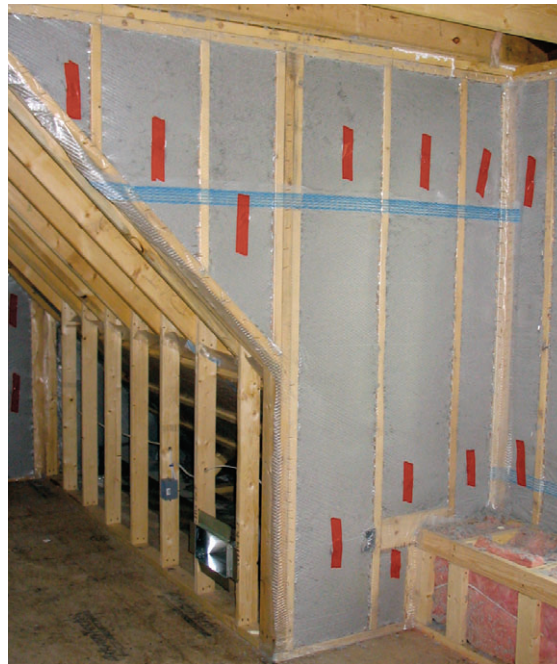
Figure 5. Par/PAC insulation — a high-density blown-in cellulose — provides good air sealing. After stapling up a reinforced poly barrier, the insulation contractor fills each bay through small holes in the plastic sheet, which are subsequently taped up.

I've always sealed the ducts in my houses, which greatly improves the efficiency of any forced-air system and creates a healthier indoor environment. On this