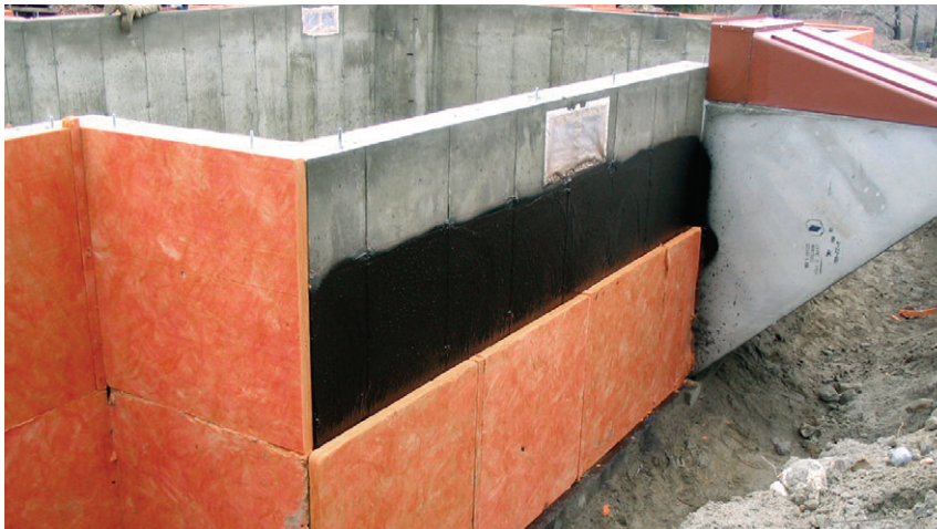
Figure 2. Warm-N-Dri foundation insulation board is pressed into a proprietary spray coating, which holds it in place for backfilling. The fiberglass board acts as a drainage mat and is said to discourage insects.

While the federal credit is independent of the Energy Star program, the same rating contractors — certified Home Energy Raters — monitor the program. I worked closely with Craig Marden of Conservation Services Group, a local Energy Star auditing company, to identify the best combination of practical, proven methods to achieve the goal. We looked at three main areas for improvement: windows, mechanical equipment, and insulation (see Figure 1).