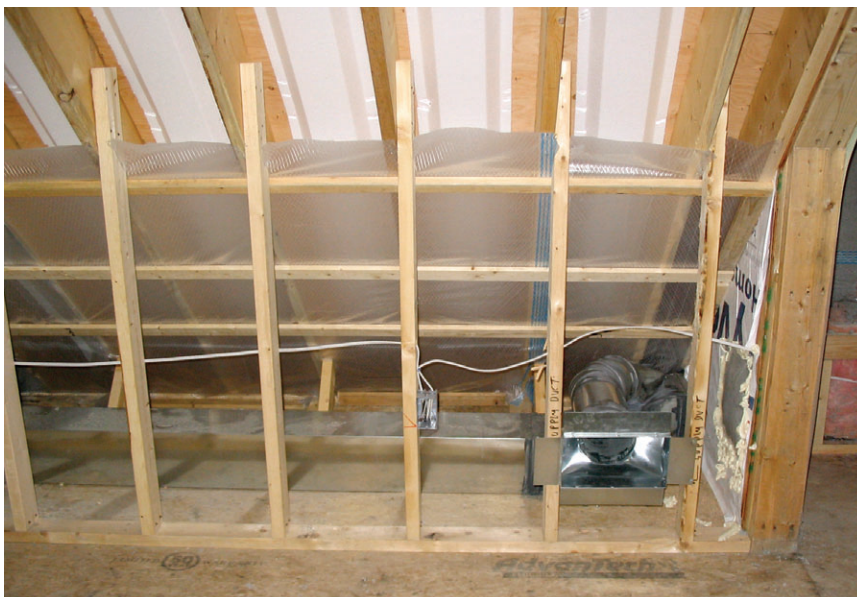
Figure 6. Insulating the roof plane behind knee walls provided conditioned space for running ductwork, which therefore doesn't need to be insulated.

In addition to increasing the overall wall R-value, I took steps to reduce windwashing of the attic insulation, as required by the 2004 IECC. I first used pre-cut cardboard baffles, but the interface with the polystyrene vent chutes on