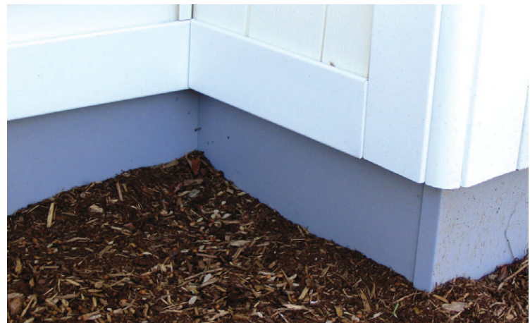
Figure 4. The siding contractor covered the exposed portion of the insulation board with vinyl coil stock. He waited until the job was nearly complete so that the vinyl wouldn’t get damaged by the work in progress.