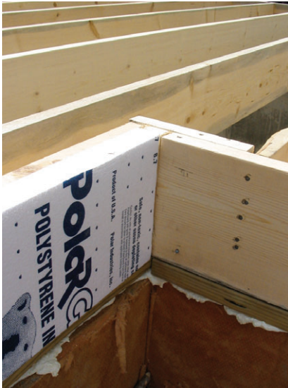
Figure 3. Because the 2x8 mudsill projects 2 inches over the top of the fiberglass insulation board, the author held the rim joist back the same distance on walls where the joists are parallel. This ensures that wall and roof loads from above get transferred directly into the concrete foundation. In addition to a foam sill gasket, he used spray foam to seal the sill to the concrete.

Because concrete is a poor insulator, the exterior insulation must be carried up to the sill plate to eliminate a “cold bridge” through the top of the concrete wall. Otherwise, a significant amount of heat can be lost through the narrow section of exposed concrete.