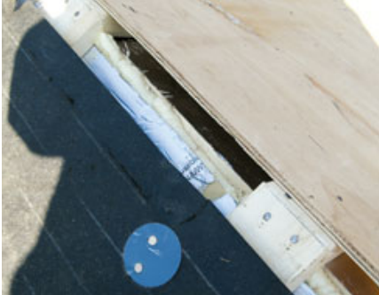
Figure 2. The crew sealed the original roof sheathing with flashing tape (above left), then installed two layers of rigid foam, staggering the seams (above) and taping the joints in the top layer (far left). A new layer of roof sheathing was installed over 2x4 battens, with gaps at the top for ridge venting (left).