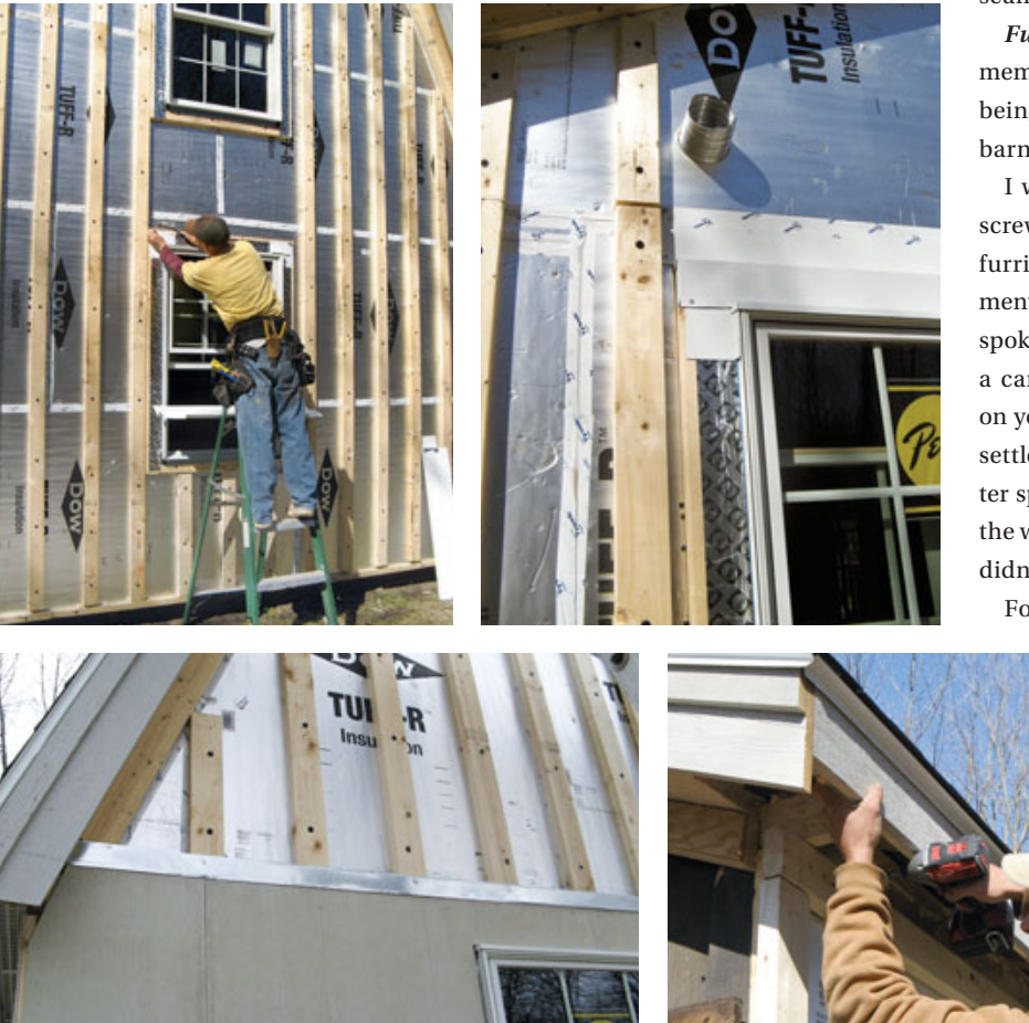
Figure 4. Once the joints in the outer layer of rigid foam had been taped, the crew installed vertical 2x4s on 16-inch centers (top left), then set the windows, flashing them to the plane of the furring members. Site-bent flashing taped to the foil-faced foam protects the window heads (top right). HardiePanels were nailed to the furring and Z-flashed at horizontal joints (above left). Rough-textured Miratec was used for trim (above right).

The 2x4s rested directly on the ledger at the base of the wall, and I decided not to worry about supplying a vent channel. I discussed this with Paul Eldrenkamp, a Boston-area remodeler and speaker at JLC Live. Paul had had the opportunity to disassemble unvented siding applications when doing additions and remodels to homes he had worked on previously, and he'd found that the unvented rainscreen wall assemblies were performing well. I was confident that the large air space provided by the 2x4 furring would