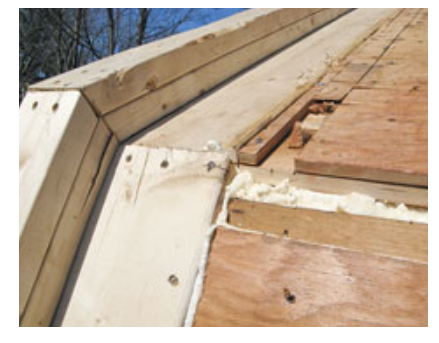
Figure 1. To accommodate the extra thickness of the exterior wall insulation, the author extended the roof overhangs with dimension lumber (above left and above). Doubled 2x4s along the edge of the rake (left) will capture the double layer of 1^{1}/2 -inch foam board to be installed on the roof. Note the spray foam used to seal gaps in the roof sheathing.

you count conductive losses through the studs. On the roof, I would use 3 inches of polyisocyanurate, for a continuous R-value of about 18.