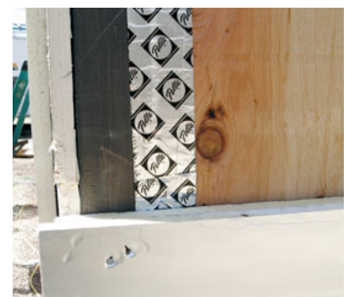
Figure 3. After installing a layer of <sup>3</sup>/4-inch plywood over the existing barnboard, the author sealed the critical wall-to-roof juncture with flashing tape, spray foam, and a rubber gasket (above left). A 2x4 ledger at the base of the wall (above) temporarily supported the double layer of 1-inch rigid foam, which was lapped at the corners (left), carefully cut in at the soffit, and sealed to framing members with spray foam (below).

We then added two layers of rigid foam insulation ( Figure 2, previous page ), 2x4 sleepers, and a new layer of roof sheathing, using the technique described by Dan Perkins in the article "Retrofitting an Insulated Cold Roof" (11/08).